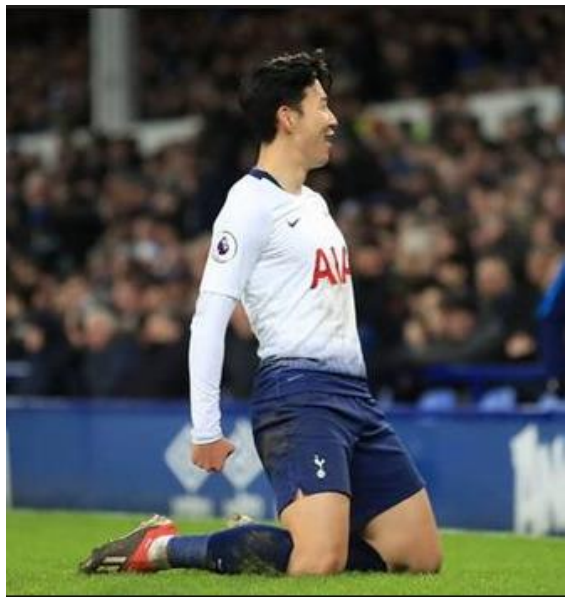
Son celebrating one of his two gaols against Everton